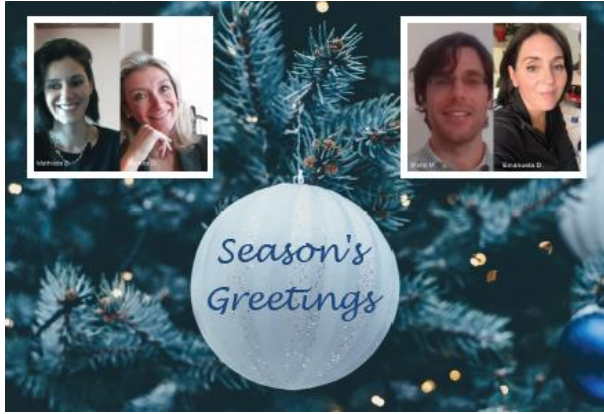
The editorial staff of IDIH Magazine (APRE Team)