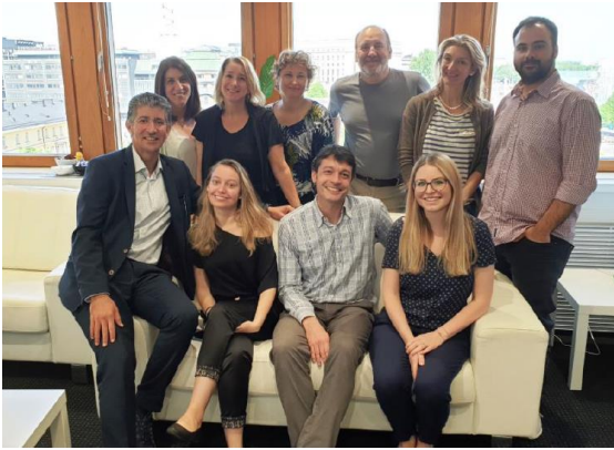
IDIH Consortium Partners at The Kick-Off Meeting In Helsinki, Finland (6-7 June, 2019)