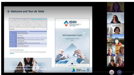
IDIH Stakeholder’s Event | 4 October, 2021