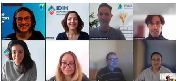
IDIH Project Meeting | 4-5 April, 2022